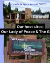
Our host sites: Our Lady of Peace & The Grotto